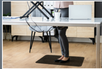
TuffComfort® Standing Desk Mat

Prolonged standing puts pressure on the feet, leg muscles, spine, neck, and shoulders which can lead to chronic pain, injuries, and muscular disorders. By providing employees with anti-fatigue mats in standing areas, or even at their desks, it can increase productivity and reduce the pain associated with standing for long periods of time. Standing on an anti-fatigue mat at your desk burns calories, reduces energy consumption, alleviates stress to the back and legs, and also reduces fatigue as a whole.